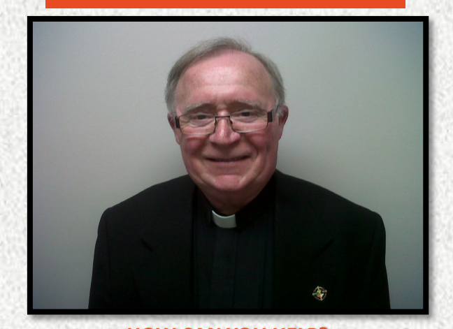
HOW CAN YOU HELP?

CONTRIBUTE TO THE ANNUAL PRIEST BENEFIT FUND COLLECTION EACH JUNE (2021 COLLECTION RESCHEDULED TO THE WEEKEND OF NOVEMBER 12-14, 2021);